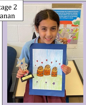
Stage 2 Hanan