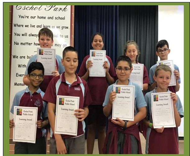
Stage 3 Learning Awards & Truth Quality Care Awards