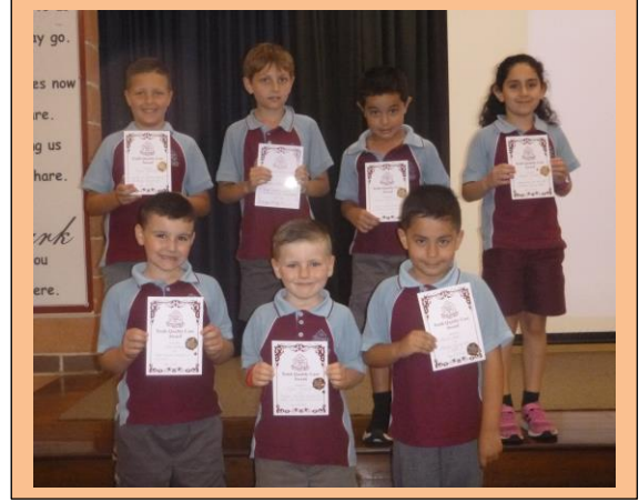
K-2 Learning Awards & Truth Quality Care Awards