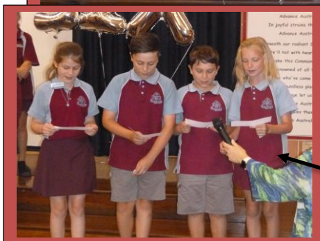
Reading the Captains Pledge

The more formal photos and an interview with these fabulous leaders will appear in the early Newsletter edition next year.