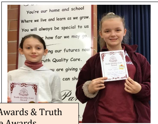
Stage 3 Learning Awards & Truth Quality Care Awards

Unfortunately we had a technical glitch with Stage 2 and have been unable to print the photos that were taken on the day. We will engage a technical expert to help us unlock these prints and hopefully will print them in the next newsletter.