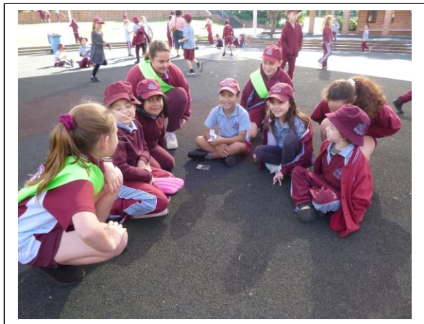
Student Leaders at work on the playground.