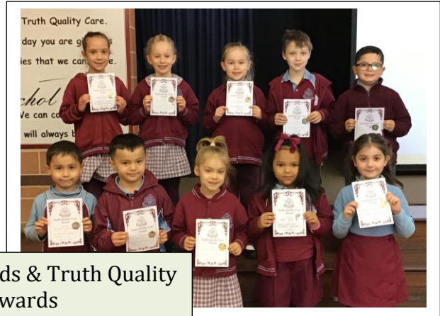
K-2 Learning Awards & Truth Quality Care Awards