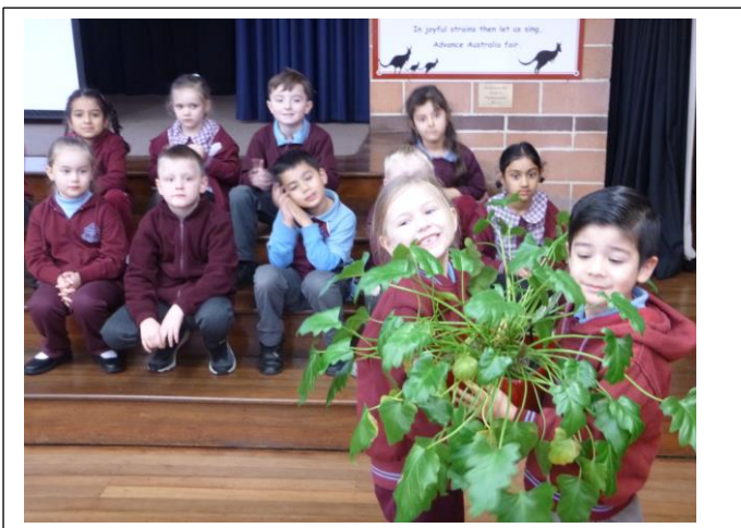
That plant is bigger than both of them!!

Unfortunately we had a technical glitch with Stage 2 and have been unable to print the photos that were taken on the day. We will engage a technical expert to help us unlock these prints and hopefully will print them in the next newsletter.