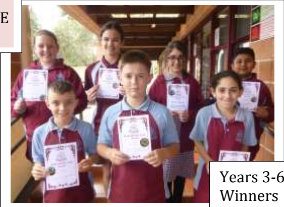
Years 3-6 Winners