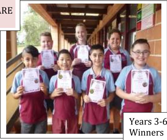
Years 3-6 Winners